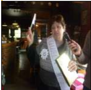
Queen of Hepburn Moorabool MCT program

The Hepburn/Moorabool Multicultural program has held two functions in the last quarter. The first function was held on June 6