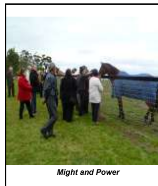
Might and Power

The Friendly Visiting Scheme also continues to do well. We have great volunteers who are doing a wonderful job in visiting the clients. Not only do they visit the client at home but at times they take them for a drive for a cup of coffee or take them for a walk. Other times they share each other's skills where both client and volunteer learn something from each other, such as craft making and painting.